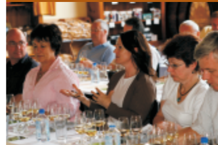
Friends of Mount Pleasant discussing the merits of Lovedale Semillon in the Semillon Masterclass

All visiting members agreed it was an outstanding success and are eagerly awaiting the 2006 member's weekend on the 18th and 19th of November, 2006."