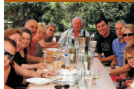
Masterclass over – time for lunch!